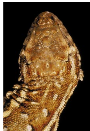
Fig. 1. Photograph of a side-blotched lizard, showing the parietal (third) eye on the top of its head.

mediated by a G-protein intracellular signaling cascade. However, Xiong and colleagues show that the parietal-eye phototransduction cascade differs from other known G-protein cascades in two important ways. First, G-protein activation increases the cGMP concentration by inhibiting the cGMP phosphodiesterase (PDE, the enzyme that hydrolyzes cGMP). G-protein inhibition of PDE has not been observed previously 2 . Second, the PDE activity in parietal-eye photoreceptors is regulated by two G proteins operating