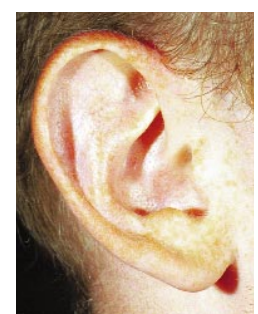
Fig. 1. The shape of the outer ear or pinna varies substantially among individuals.